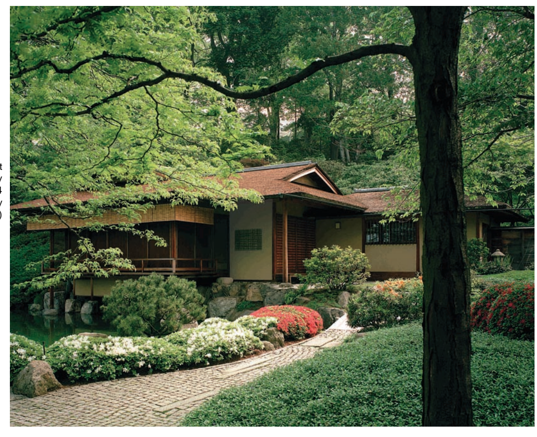
(Fig. 4) The teahouse at Pocantico designed by Junzō Yoshimura, 1964

square metres; the Pocantico house is less than forty). It was built in the sukiya style, characterized by restrained elegance and traditional rustic simplicity, which reached its zenith in the Momoyama era (1569-1603) when it was used both for the residences of Japanese nobility and for abbots' quarters within temple precincts (Fig. 4). The interior of the teahouse is divided by fusuma into one room of twelve tatami (a tatami