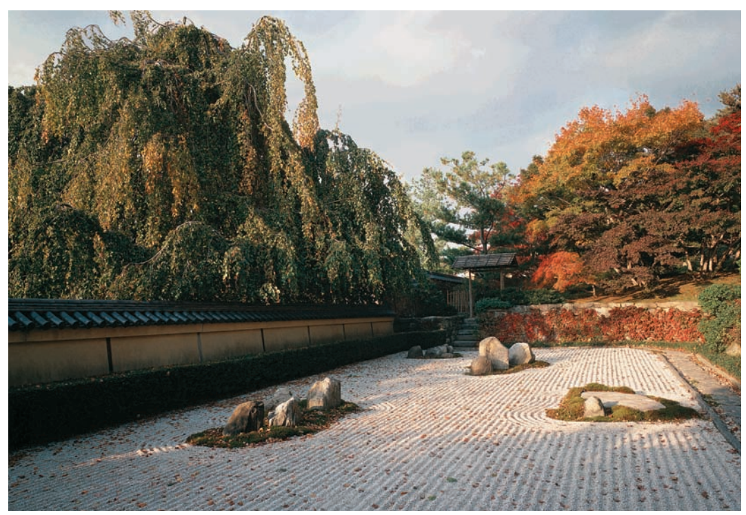
(Fig. 6) The dry landscape garden at Pocantico, 1964

landscape. From the main gate at the road, a path of stepping stones banked by liriope (border grass, or lily turf) leads over an arched stone bridge through a small gate, with a roof made from the bark of hinoki cypress, to the pond in front of the teahouse. Beyond the teahouse the path divides. One fork leads through a small gate (with a roof of madake bamboo) to the dry-landscape garden (Fig. 6). The design is patterned