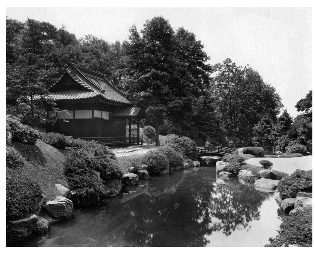
(Fig. 2) The 1909 Japanese teahouse at Pocantico, c. 1920 The Rockefeller Archive Center The Rockefeller University, Sleepy Hollow, New York (Photography by Mattie Edwards Hewitt)

Archival photographs and letters record the 1908-09 Japanese garden and teahouse at Pocantico (Figs 1 and 2). The early garden was a hill and pond garden, gathering the water of the natural wetland area. Azaleas, pines, Japanese maple and weeping cherries were planted. To the north, a path and stream banked with juniper and carefully pruned