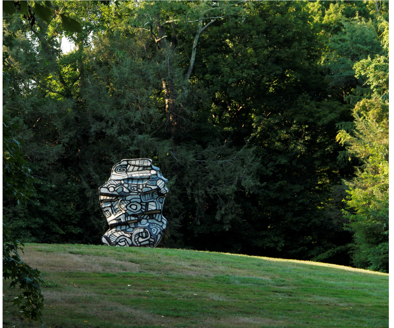
L'Erection Logologique Bleue (1967-69), Jean Dubuffet

The Pocantico campus spans over 200 acres and includes over 10 buildings and 94 outdoor sculptures.