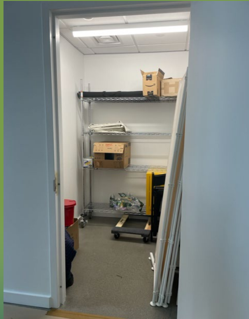
The kitchenette and closet