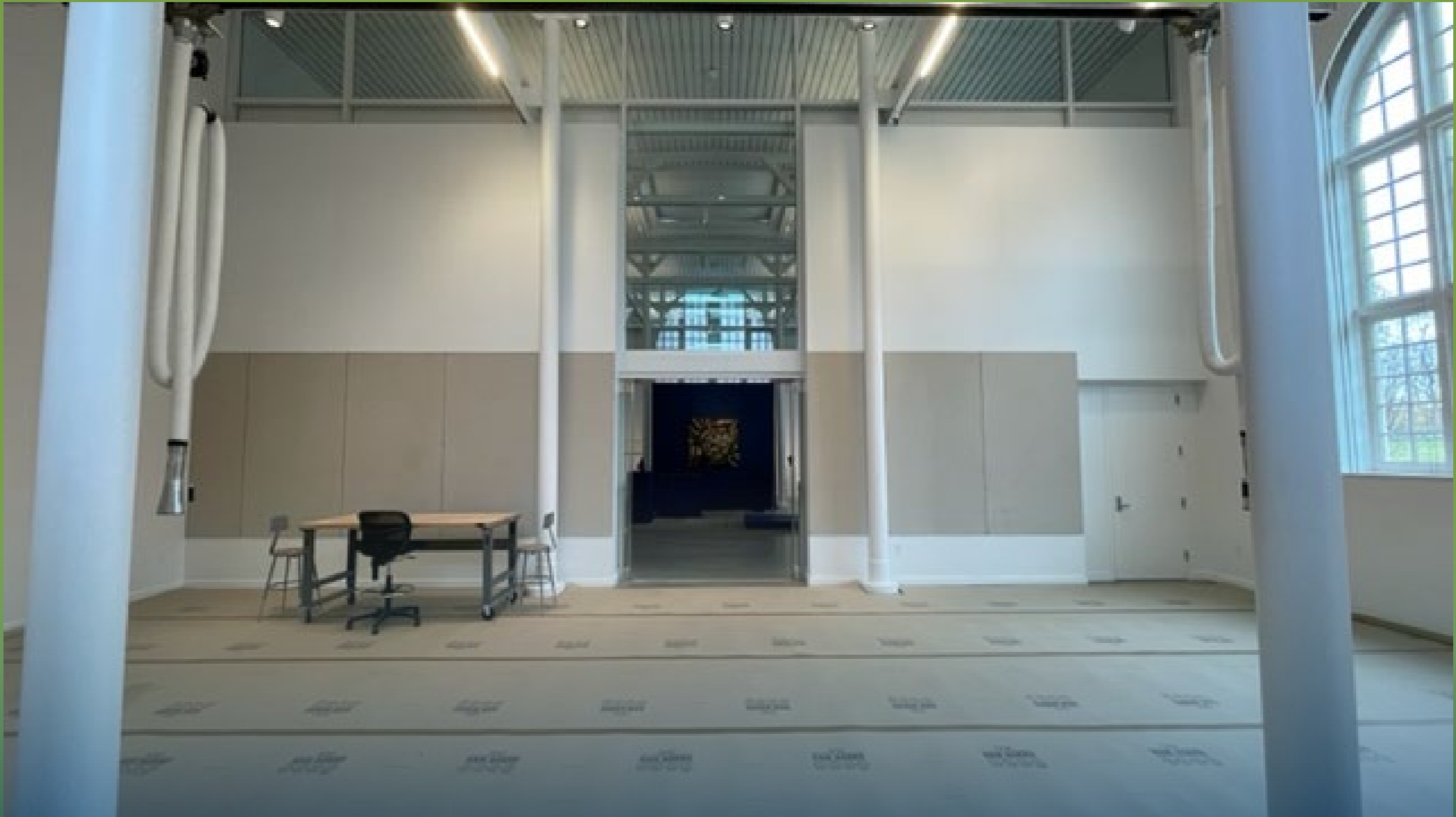
View of studio from exterior door with floor covered