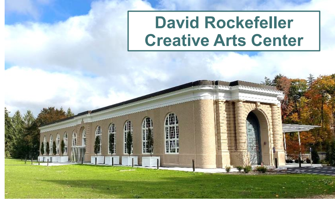
David Rockefeller Creative Arts Center